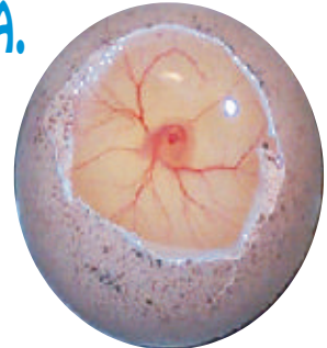
4 Day Old Embryo with CO 2 injection