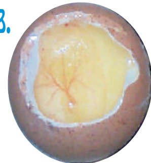
4 Day Old Embryo without CO 2 injection

Both eggs are the same age and from the same flock and incubated under identical conditions except that egg A was exposed to artificially injected CO 2 .